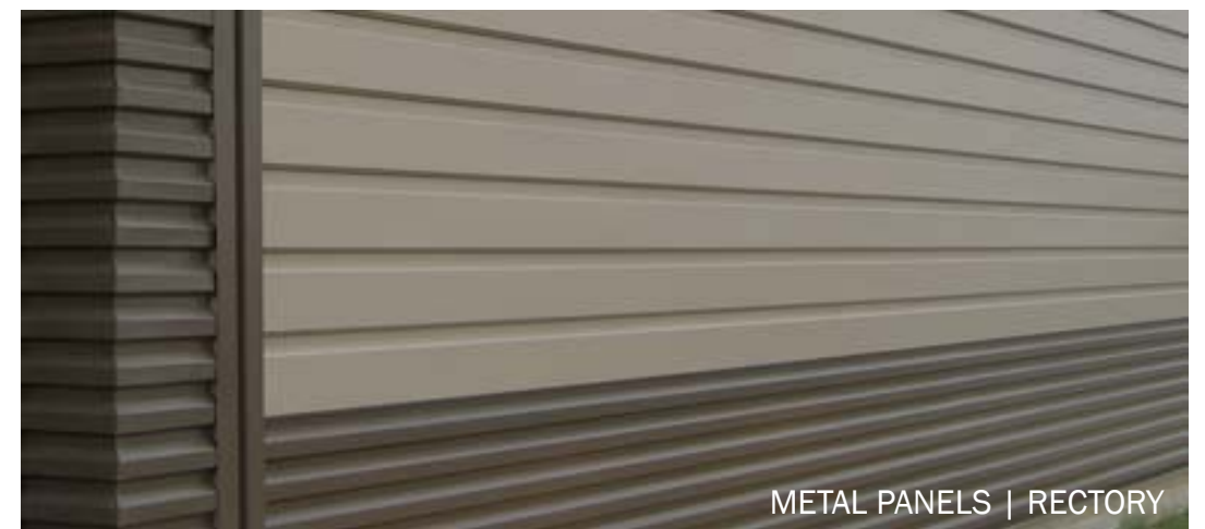
METAL PANELS | RECTORY