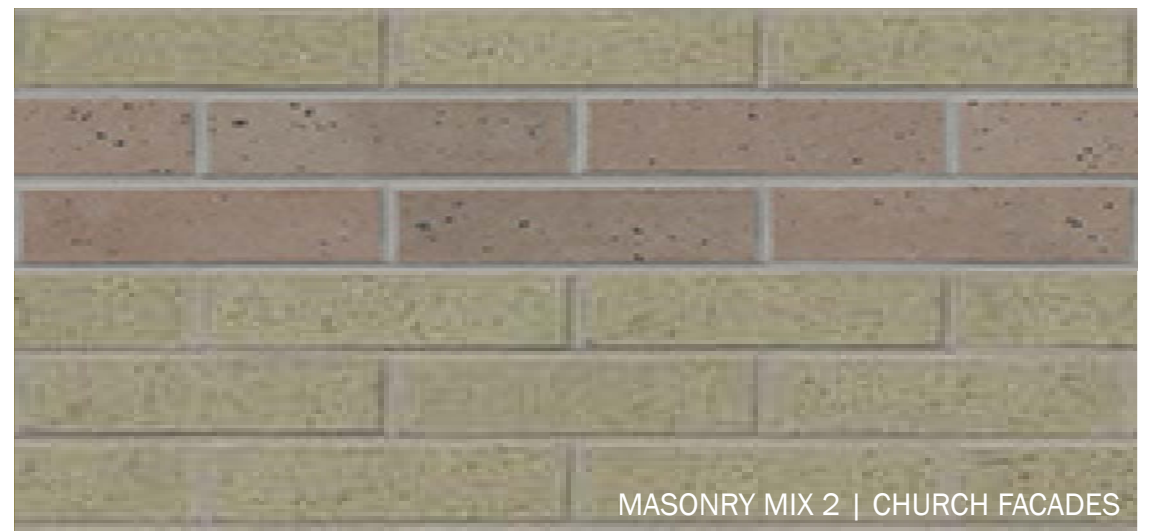
MASONRY MIX 2 | CHURCH FACADES