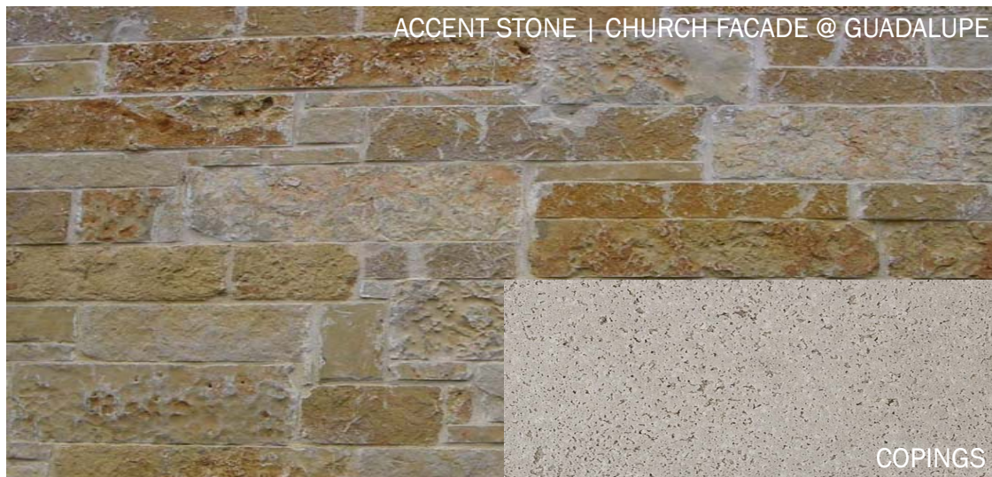
ACCENT STONE | CHURCH FACADE @ GUADALUPE