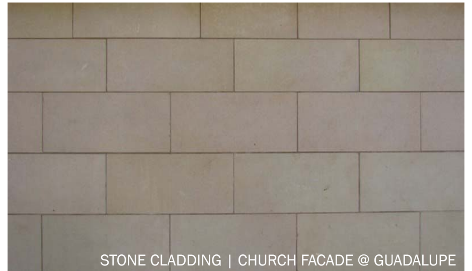
STONE CLADDING | CHURCH FACADE @ GUADALUPE