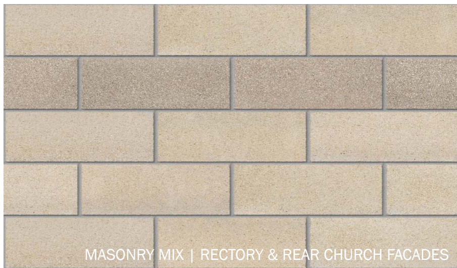
MASONRY MIX | RECTORY & REAR CHURCH FACADES